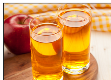
CLEAR JUICE (APPLE, GRAPE, CRANBERRY)