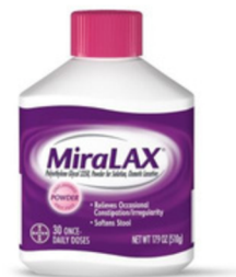
Miralax (14 doses size)