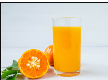
NO ORANGE JUICE