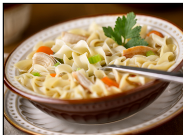
NO SOUP WITH CHUNKS OF FOOD