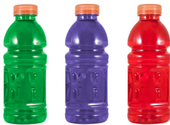
Sports Drinks (64 ounces)

Before starting your bowel prep, please have sports drinks, Dulcolax Tablets (4 tablets), and Miralax (14 doses size) on hand. Follow the timelines provided on the the next page for when you should start your prep.