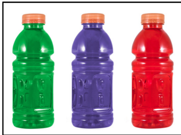
CLEAR SPORTS DRINKS