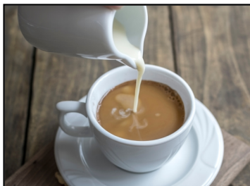
NO COFFEE WITH CREAM