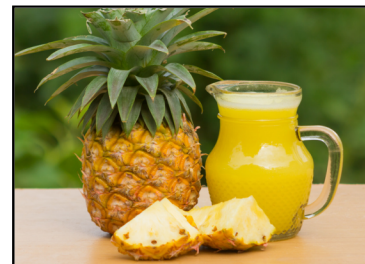
NO PINEAPPLE JUICE