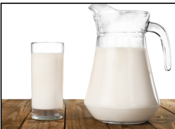
NO MILK OR DAIRY

YOU SHOULD NOT DRINK ALCOHOL WHILE PREPARING FOR YOUR TEST.