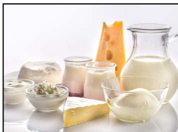
NO DAIRY PRODUCTS