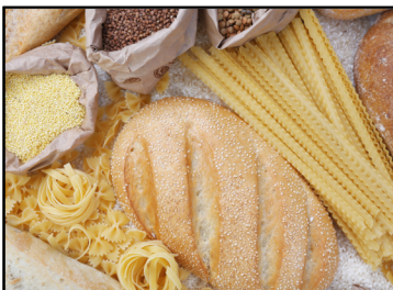
NO BREADS, GRAINS, RICE